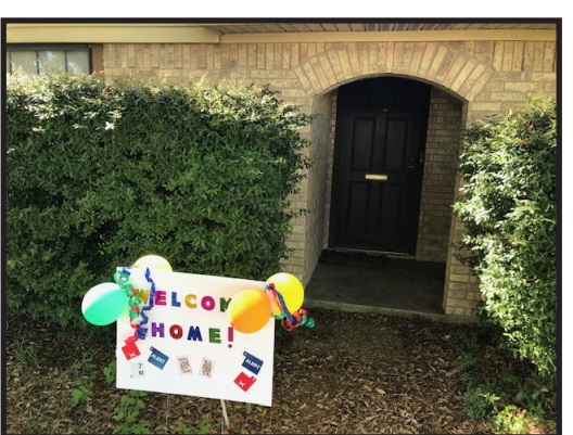
A Great Welcome Home Greeting