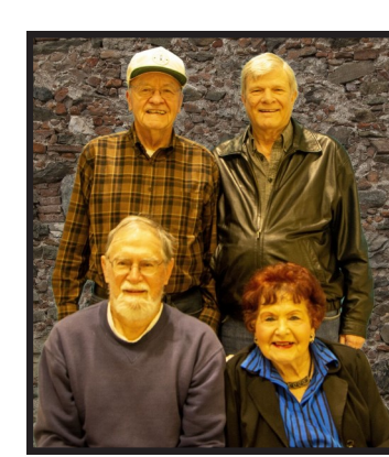
Sunday Swiss Bkt 1