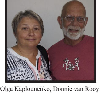
Fri Morn 0-750 Pairs A